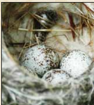
Swamp Sparrow Nest