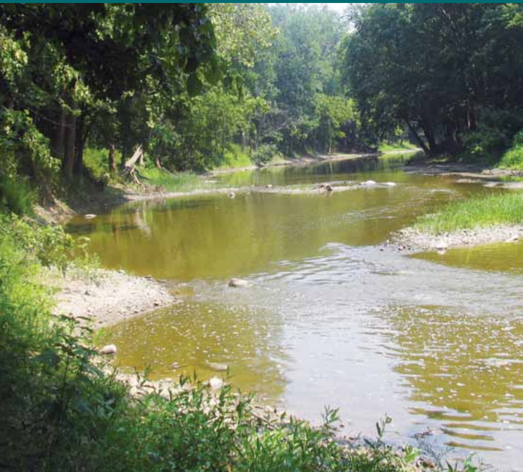
ACREAGE: 86.7 | YEAR ACQUIRED: 1973, 2000