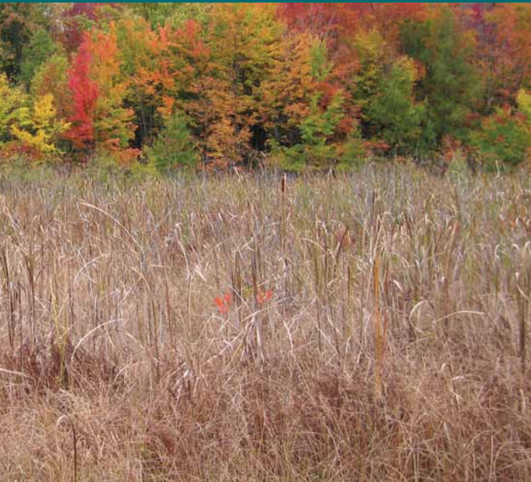
ACREAGE: 36.7 | YEAR ACQUIRED: 2003

Glennwood contains a circumneutral bog, one of only 15 in Indiana. The bog once was a lake, but it is now nearly filled with a springy mat of mosses, ferns and sedges resting on a bed of peat. Poison sumac, pin oak, willow and red maple surround the bog area. In the forest around the bog grow Canadian mayflower, shiny club moss and sarsaparilla, as well as cinnamon, crested shield and royal ferns. The preserve is noted for spectacular fall color.