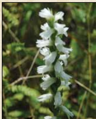
Nodding Lady's Tresses

Glennwood contains a circumneutral bog, one of only 15 in Indiana. The bog once was a lake, but it is now nearly filled with a springy mat of mosses, ferns and sedges resting on a bed of peat. Poison sumac, pin oak, willow and red maple surround the bog area. In the forest around the bog grow Canadian mayflower, shiny club moss and sarsaparilla, as well as cinnamon, crested shield and royal ferns. The preserve is noted for spectacular fall color.