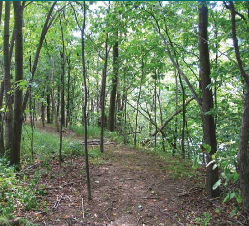
ACREAGE: 0.9 | YEAR ACQUIRED: 1976

The Maumee River Overlook is a high forested embankment overlooking the Maumee River. A water-powered sawmill was once located nearby on an outcrop of rocks in the river. Lumber from the mill was used in the Wabash & Erie Canal, which ran along the south border of the preserve.