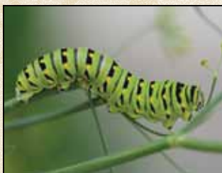
Black Swallowtail Caterpillar

The Maumee River Overlook is a high forested embankment overlooking the Maumee River. A water-powered sawmill was once located nearby on an outcrop of rocks in the river. Lumber from the mill was used in the Wabash & Erie Canal, which ran along the south border of the preserve.