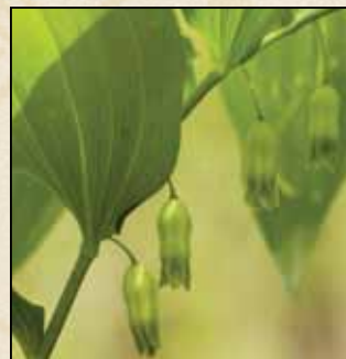
False Solomon's Seal