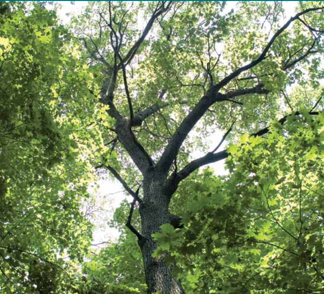
ACREAGE: 61.5 | YEAR ACQUIRED: 1976, 2002