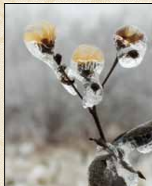
New York Ironweed

At this reserve, you will see three stages of forest succession. First, there is an open meadow with clumps of hawthorn and gray dogwood. Then, there are early-stage woods of elm, shagbark hickory and maple, plus a mature forest of sugar maple, beech, oak and shagbark and shellbark hickory. Finally, there is a beech/maple forest. The three habitats and their variety of trees also mean a variety of birds and wildflowers.