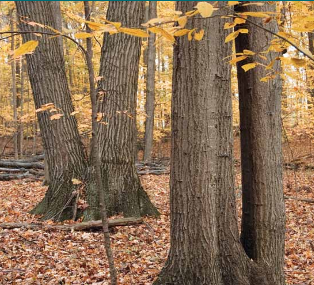
ACREAGE: 7.9 | YEAR ACQUIRED: 1974

Fox Fire Woods is high, well-drained land producing a woodland where the dominant trees are oak and hickory. Along the west side are wild plum and hawthorn trees. The Fox Fire name is from a fungus that grows on decaying vegetation on the woodland floor and glows eerily in the dark.