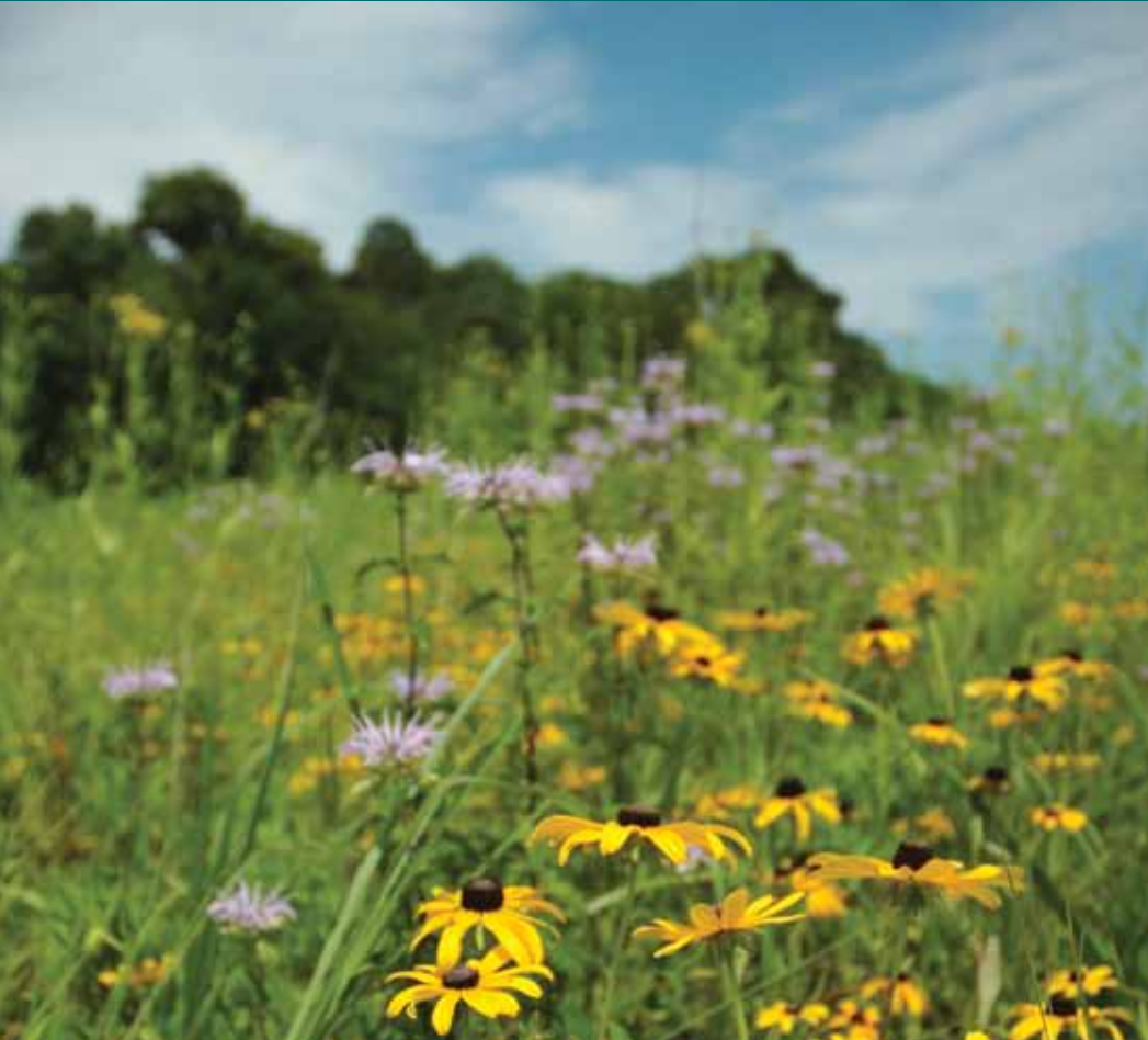
ACREAGE: 46.8 | YEAR ACQUIRED: 2007

Sap was once harvested from the maples here and boiled down into syrup. This beech/maple woods also includes tulip, sycamore, black cherry and blue ash – an unusual tree in the area. The grinding of glaciers over the area left several depressions that are now small ponds, the largest approximately an acre and a half. Flowering trillium blooms abundantly here in spring, and tall-grass prairie plants have been established in a field.