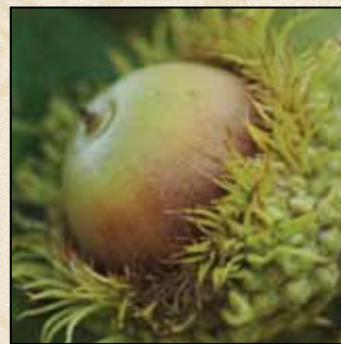
Burr Oak Acorn

Hammer Wald is in various stages of forest succession. There's a field that was cultivated and now has scattered ash, red maple, hawthorn, basswood, elm, black walnut and hop hornbeam – trees of early succession. There's a mature forest of beech, hickory, sugar maple, tulip, cherry and oak trees. The variety of trees and stages of tree growth are matched by the variety of birds and wildflowers.