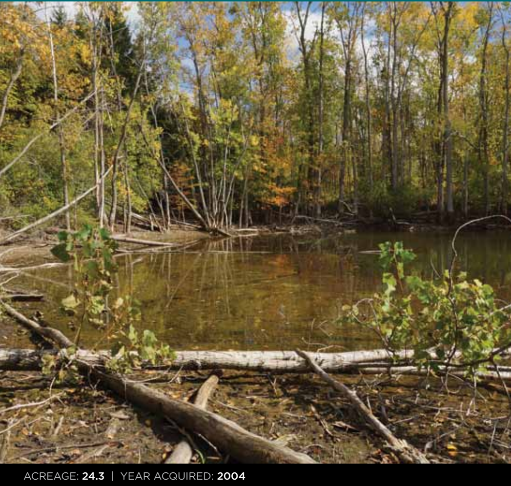
ACREAGE: 24.3 | YEAR ACQUIRED: 2004

The Little Wabash River Nature Preserve is a place of trees. The land donor constructed a pond and planted cedar, cottonwood and willow trees around it. River birch grow along the trail, as well as scattered northern white oak and red maple on the higher ground. Interspersed are spruce, basswood, hickory, beech, elm, tulip, black cherry, sweetgum, dogwood, sumac and bald cypress—some growing adventitiously from planted specimens. White-tailed deer are commonly seen on the property.