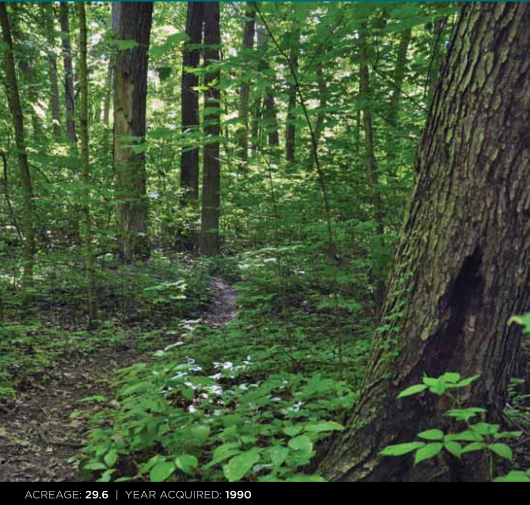
ACREAGE: 29.6 | YEAR ACQUIRED: 1990