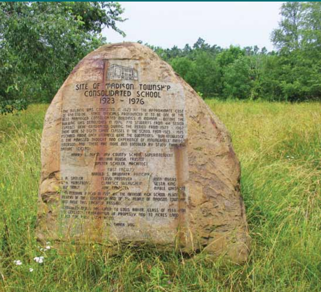
ACREAGE: 27.3 | YEAR ACQUIRED: 1994

From 1854 to 1975, students attended school at this site, first in a log cabin, then in a “modern” school built in 1923. Today, a boulder with an inscription commemorates the school, and sugar maple, ash, hickory and oak trees grow where students once played. There’s an understory of smaller trees, shrubs and wildflowers. Slowly the trees are maturing, and through natural succession, the other vegetation is changing.