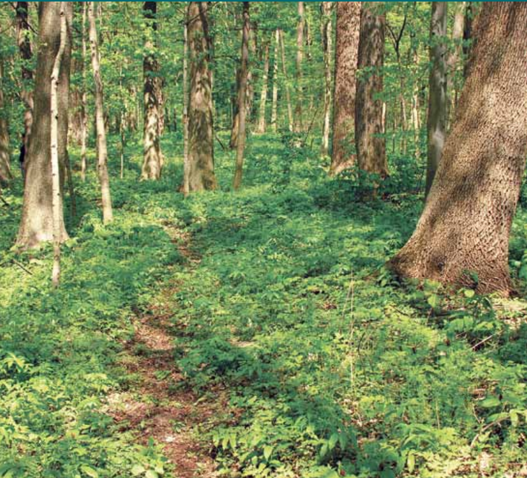
ACREAGE: 192.2 | YEAR ACQUIRED: 1982