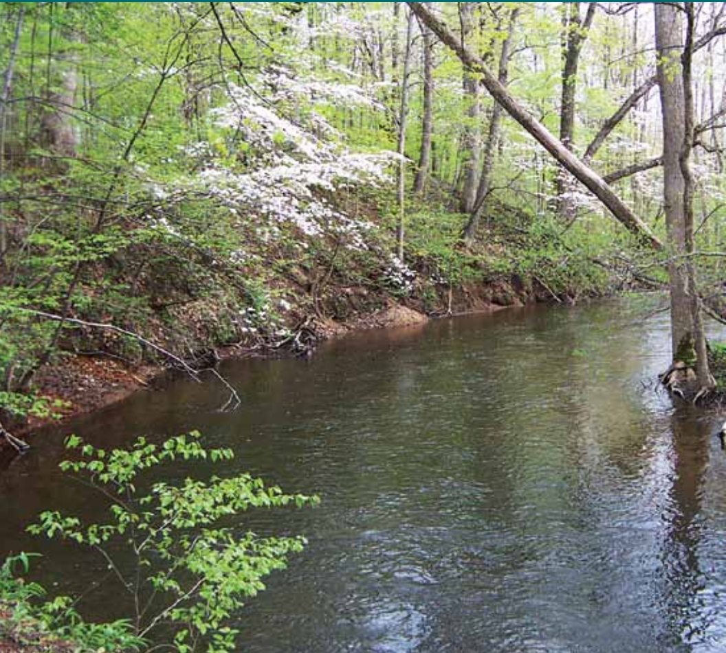
ACREAGE: 135.2 | YEAR ACQUIRED: 1996, 1997