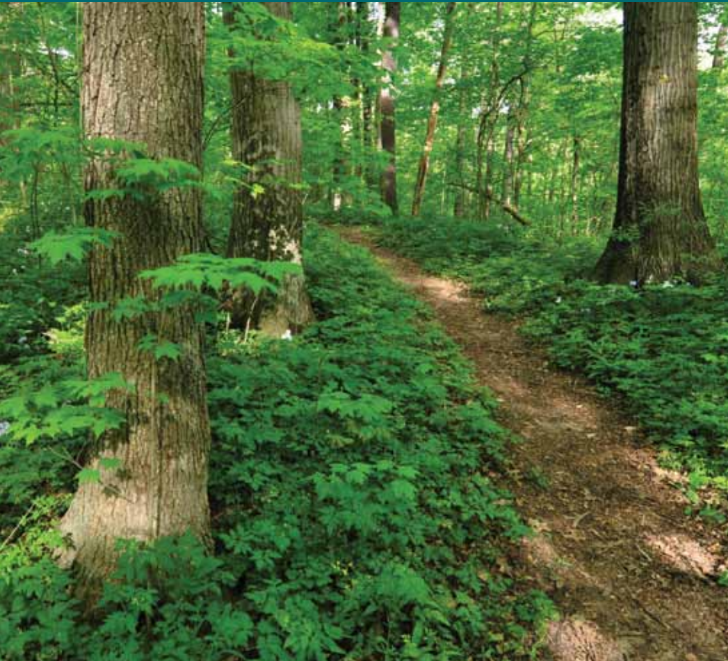
ACREAGE: 65.0 | YEAR ACQUIRED: 1961, 1964