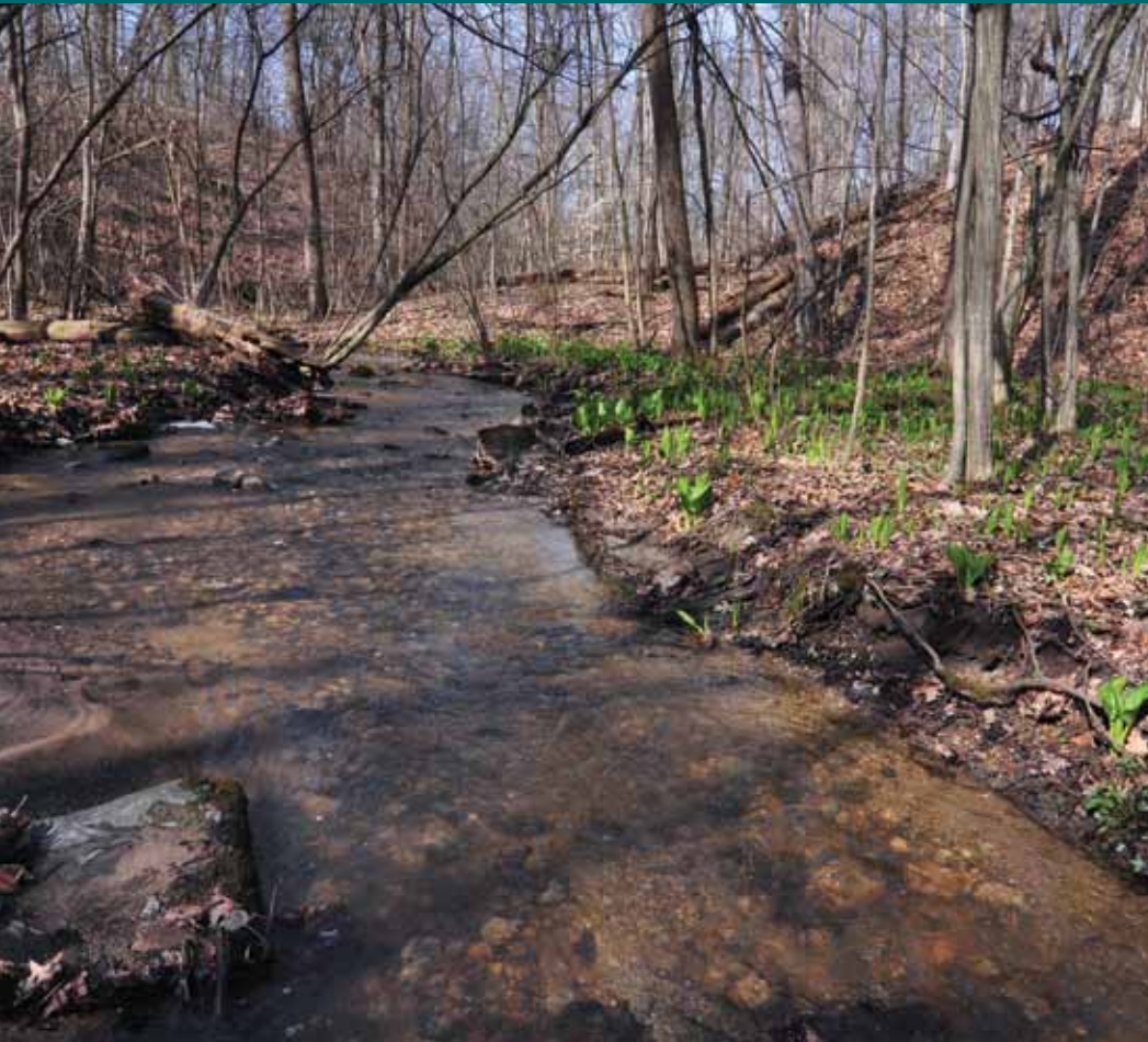
ACREAGE: 26.8 | YEAR ACQUIRED: 1995