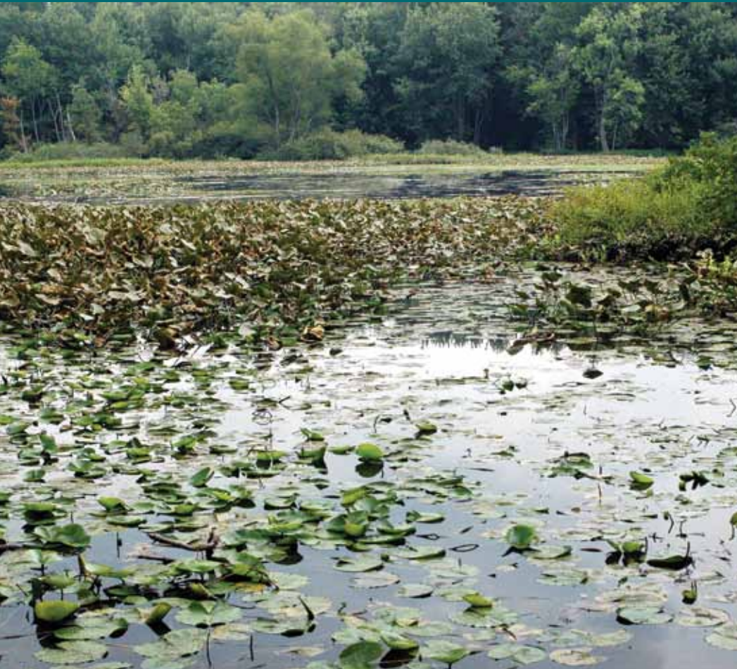
ACREAGE: 124.0 | YEAR ACQUIRED: 2004, 2012

These preserves protect all of Pigeon Pond and portions of Pigeon Lake and Pigeon Creek, reminding us of a time when wild pigeons visited the area. Rolling meadows, wetland forests and a kame-like hill offer opportunities for good viewing of white-tailed deer and wild turkeys. In the summertime, cardinal flower, white snakeroot and tall blue bellflower greet visitors with their respective red, white and blue blossoms.