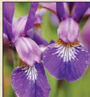
Blue Flag Iris