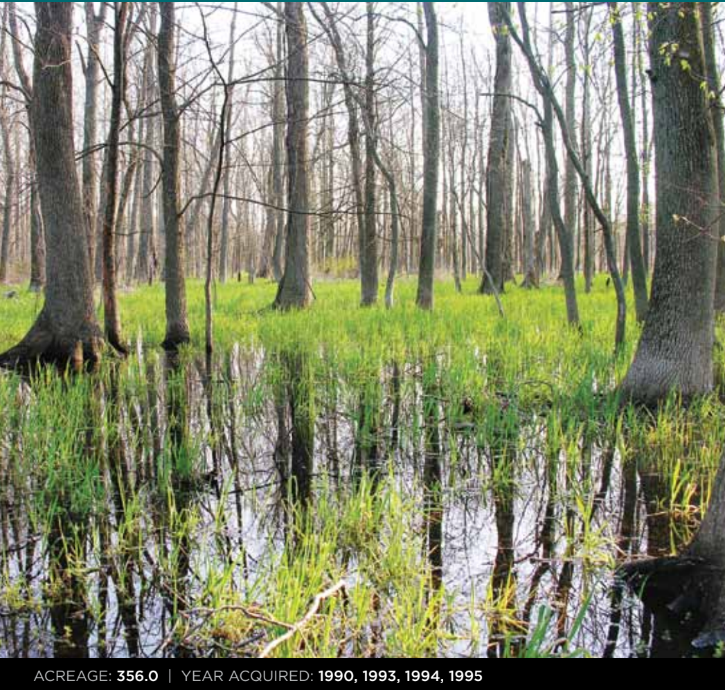
ACREAGE: 356.0 | YEAR ACQUIRED: 1990, 1993, 1994, 1995