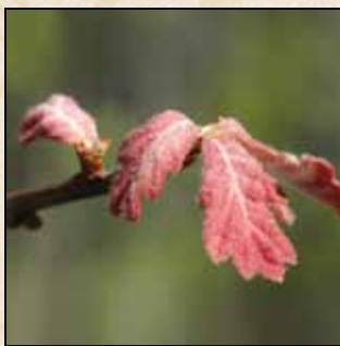
Immature White Oak Leaf

Here are a ridge moraine, a kettle-hole lake and boulders from rocky outcrops farther north, all visible evidence of the passing of the great glaciers. The low wetland was once an acidic bog with sphagnum moss and cranberries. Now tamarack, yellow birch and red maple grow there along with tussocks of cinnamon fern, mountain holly and winterberry. On the drier land is an oak/hickory forest with red, white and black oak, as well as shagbark hickory, and in the understory are sassafras, dogwood and hazelnut. The varied habitat means a variety of birds and wildflowers are present.