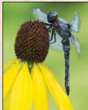
Swift Long-winged Skimmer on Cutleaf Coneflower

Beechwood is adjacent to Pokagon State Park and has a mixture of habitats, including a beech/maple forest; yellow birch, red maple, red elm and blue beech trees; rolling meadows; thickets with dogwood, poison sumac, elderberry and spicebush; and a fen. Birds and wildflowers are as varied as the cover.