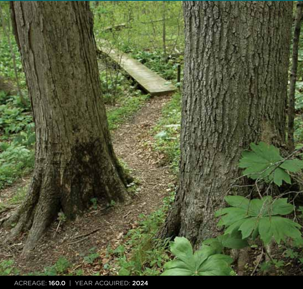
ACREAGE: 160.0 | YEAR ACQUIRED: 2024