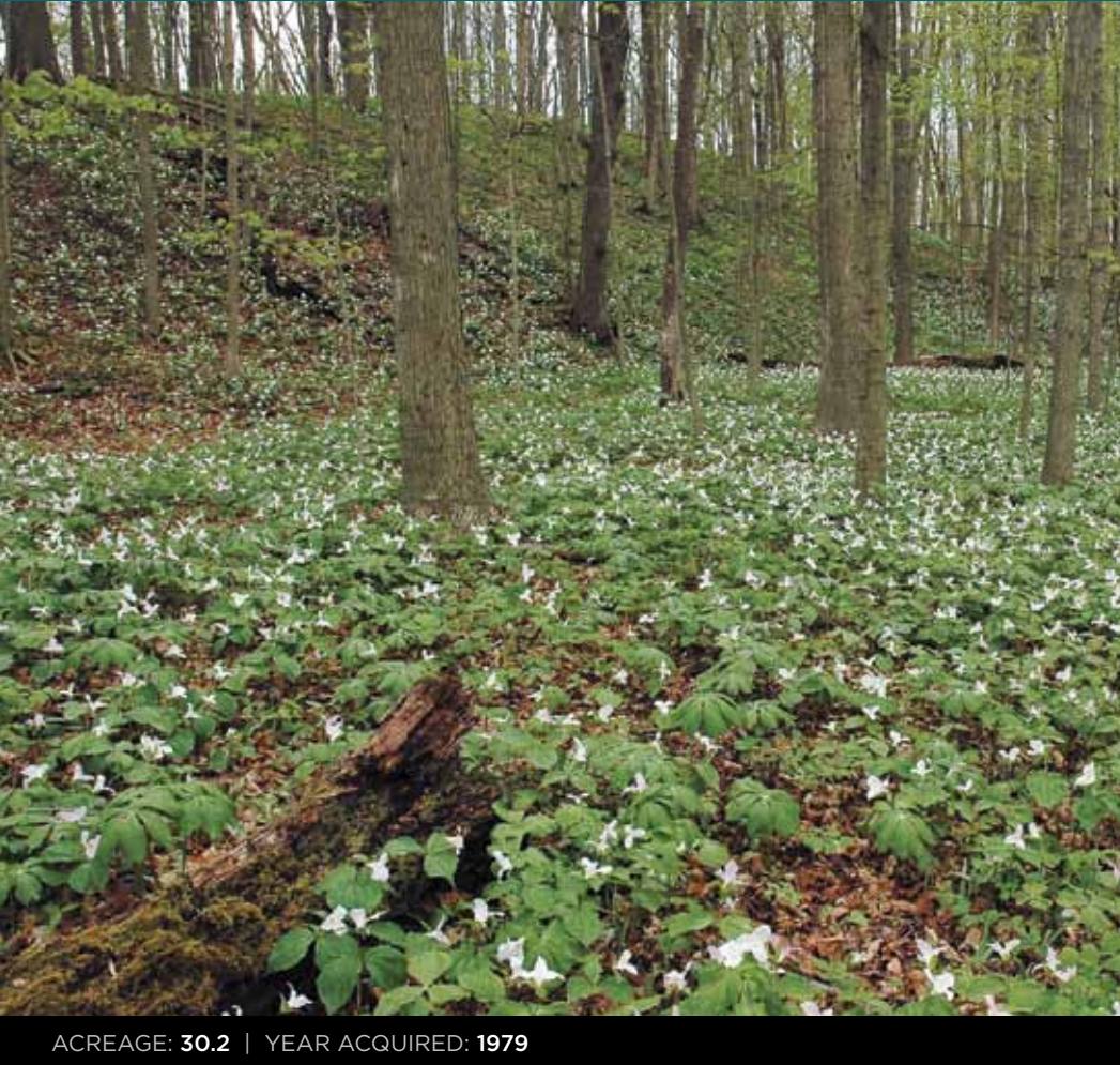
ACREAGE: 30.2 | YEAR ACQUIRED: 1979