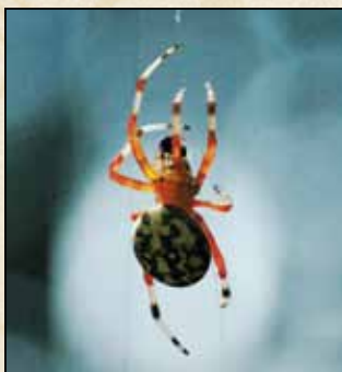
Marbled Orb Weaver Spider

This preserve contains both upland and floodplain forest divided by the serpentine flow of Flat Rock Creek. The creek and mature forest attract abundant wildlife and provide great scenic vistas. Flat Rock Creek is one of very few unaltered creeks remaining in the area. Its meandering course has been directed only by its own movement through the centuries.