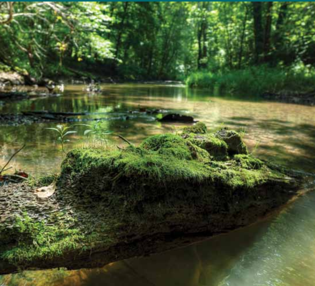
ACREAGE: 79.0 | YEAR ACQUIRED: 1994